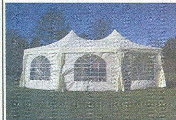
PARTY TENT MARQUEE

6.8 x 5.0 m Party Marquee Octagon with French window Polyester canvas PVC coating 280g/m 2 . Perfect for 25 persons. 100% waterproof roof cover. Price £ GBP 279 + VAT delivery. Tel.: 7221 0220, www.dancecovershop.co.uk mail: mail@dancocover.co.uk