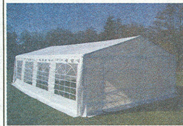
PARTY TENT MARQUEE

6.8 x 5.0 m Party Marquee Octagon with French window Polyester canvas PVC coating 280g/m 2 . Perfect for 25 persons. 100% waterproof roof cover. Price £ GBP 279 + VAT delivery. Tel.: 7221 0220, www.dancecovershop.co.uk mail: mail@dancocover.co.uk